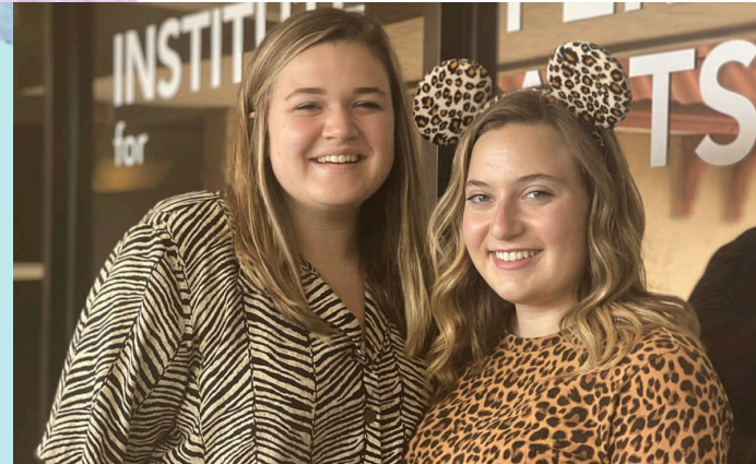
LEFT: VIPA Interns in VHS Spirit Week attire

Internships in Arts Administration are available for senior high school students. Past internships have focused in patron relations, education, graphic design, communication, and technical development.