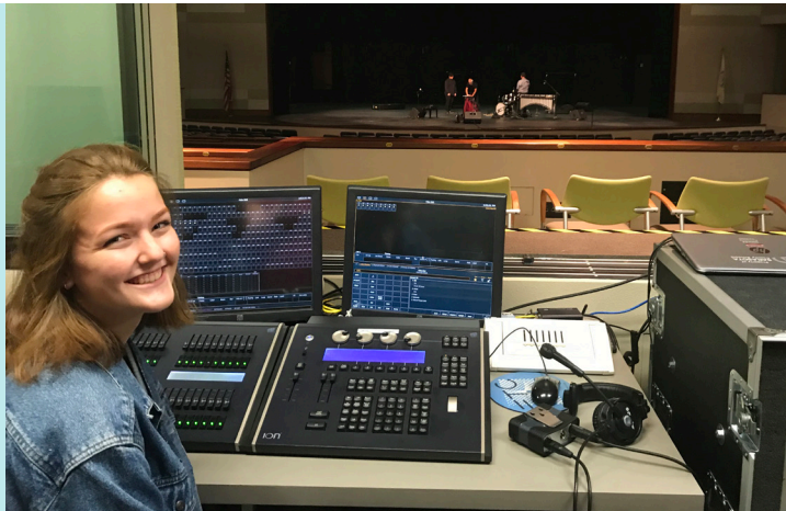
LEFT: VIPA Apprentice assisting on the lighting board

The Apprenticeship Program is a unique experience for Venice High School juniors and seniors who are paid to work on the professional performances that come through the VPAC. Students are given the opportunity to work hands-on with industry professionals in all areas of the performing arts from lighting and sound, to house management, and patron relations while also learning valuable life skills including communication, collaboration, creativity, critical thinking, project management, and empathy.