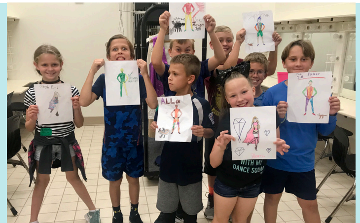
RIGHT: Venice Elementary students designed their own characters during a Tech Talks session

Starting in the summer of 2020, VIPA will hold Summer Camps on campus. For creative and theatrical students in elementary and middle school, this might be what you are looking for during summer break. High school students can apply for a counselor in training position.