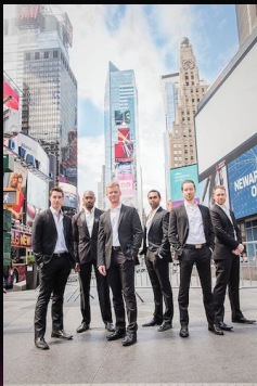
The Broadway Boys